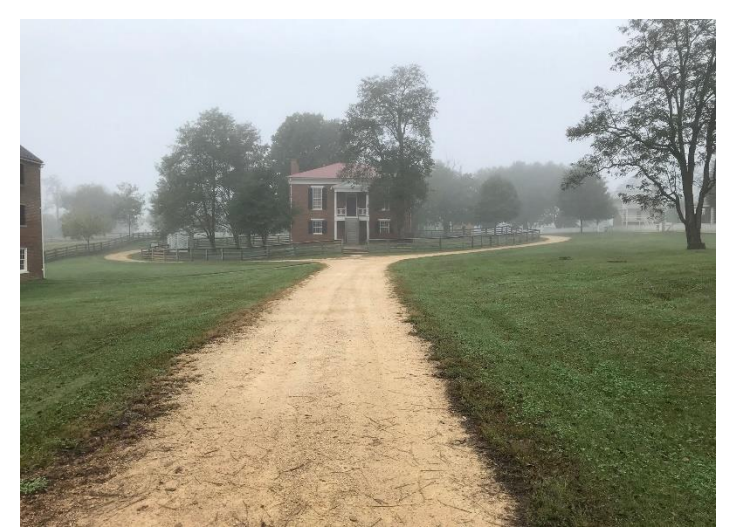
The village of Appomattox Court House shrouded in fog much like it would have been on the morning of April 9. This is the scene the marines saw as they marched up the Richmond-Lynchburg Stage Road to stack their arms.

Among these infantrymen were four marine officers and twenty-two enlisted men who had remained devoted to the corps and the Confederacy to the very end.<sup>544</sup> These marines did not have a flag to lay down but rather simply laid down their muskets signaling the beginning of the end of the Confederate States Marine Corps.