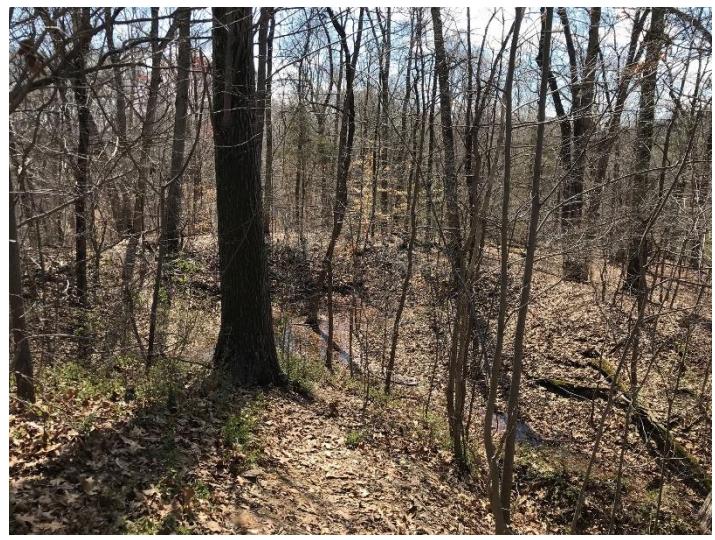
Pictured here are the remnants of the outer earthworks of Fort Drewry where the marines primarily served during the Second Battle of Drewry's Bluff.

Marine Battalion was warned that that marines should be prepared to mount a defense.<sup>373</sup> Upon receiving this warning, the marines positioned themselves in the outer earthworks of Fort Drewry and waited for the enemy to arrive.<sup>374</sup> Although the Union forces did shell the Confederates at the Bluff on May 9, the marines saw little action until May 12.<sup>375</sup>