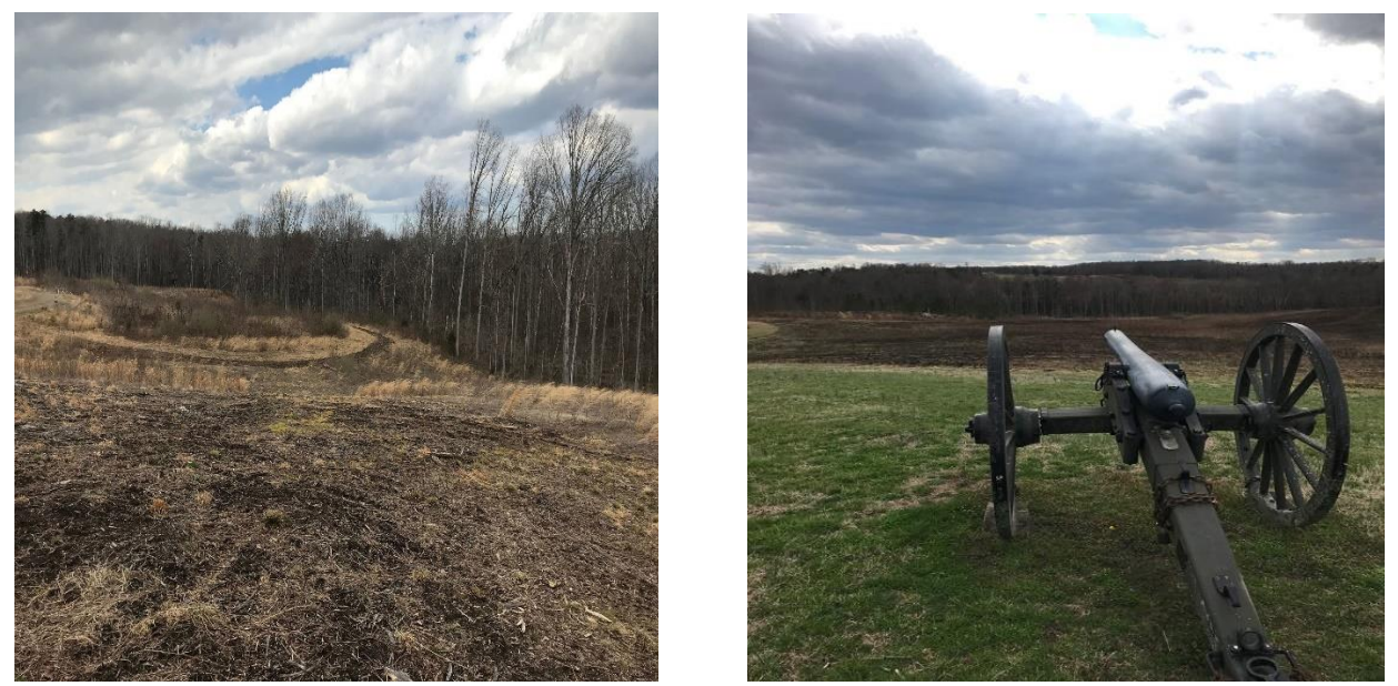
Left: The hillside on which the marines were positioned during the Battle of Sailor's Creek. Little Sailor's is located just inside the tree line at the bottom of the hill. Right: This field piece marks the location of where the Union guns were situated during the Battle of Sailor's Creek. The marines would have been located just on the other side of the tree line seen in this picture. Only about 800 yards separated the two forces.

However, following this short moment of triumph, the marines and other Confederate forces jumped over their fortifications and charged the enemy, pushing them back across the swollen creek.<sup>539</sup> After the Confederates were well past their own fortifications, the Federals then charged again with the aid of canister fire from their artillery.<sup>540</sup> During and following this charge, the Confederates were thrown into disarray, and many of the them, including General Ewell, were captured. However, the marine battalion was able to slip away into the forest and take up a battle line which remained uncontested until Brigadier General Joseph Keifer discovered it later in the evening.<sup>541</sup> Shortly thereafter, General Keifer went to Flag-Officer Tucker and accepted the surrender of the Naval Brigade.<sup>542</sup>