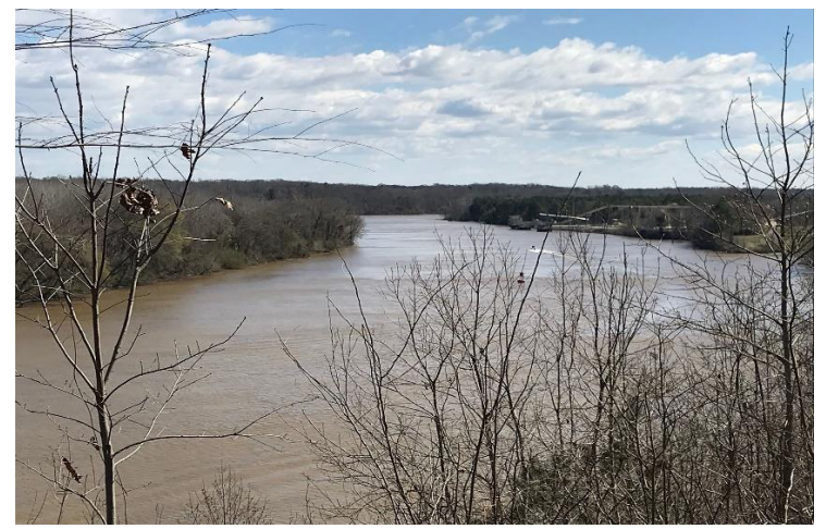
This is the view the down river from the fort at Drewry's Bluff. A buoy can be seen through the trees, and it sits approximately where the Jamestown and other obstructions were located.

bluffs at the river's edge downstream from Drewry's Bluff.<sup>257</sup> There, the marines manned rifle pits spread out over several miles and partially concealed by underbrush and waited for the Unions ships to reach their positions.<sup>258</sup> Although the marines were stationed on land in rifle pits and not atop a ship's riggings, their positions allowed them to carry out one of their traditional roles and act as sharpshooters.<sup>259</sup> Incidentally, the marines' elevated position on the bluffs simulated a ship's riggings in a way and helped the marines act as well on land as they did on the sea. When the Union ships lead by the USS Galena approached the marines, Captain Simms reported that they "…immediately opened a sharp fire upon them, killing three of the crew of the Galena certainly, and no doubt many more."<sup>260</sup> The commanding officer of the USS Aroostook reported that his command "proceeded up the river, under sharp fire of musketry from both banks."<sup>261</sup> Following the Battle of Drewry's Bluff, several other Union officers mentioned the marine sharpshooters and the damage they inflicted.<sup>262</sup>