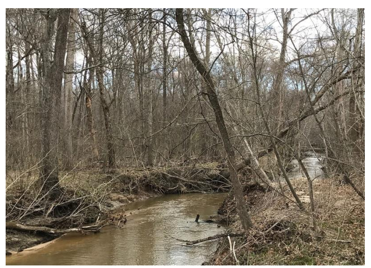
Little Sailor's Creek where the majority of the marine's action during the Battle of Sailor's Creek took place. During the battle, the creek was flooded out of its banks.

When the battle was over, General Ewell, seven other generals, and 8000 men had been killed, captured, or wounded. Included in this number were seven marine officers and forty-five enlisted men.<sup>543</sup> Although April 6 proved to be one of the most disastrous single days for the Confederacy and the majority of marines in Virginia were captured, a few dozen marines managed to escape and continue marching towards a small village called Appomattox Court House.