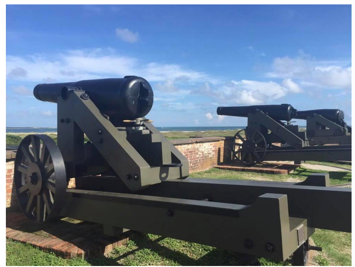
Two Model 1841 Navy 32-pounders and a Model 1861 Confederate Rodman eight-inch Columbiad currently on display at Fort Macon State Park. A detachment of Confederate Marines was sent to Fort Macon to help train the fort's garrison in the operation of naval guns such as these.

time, some reports show that a small detachment of marines accompanied Confederate naval officers to Fort Macon near Beaufort, NC, in order to train the coastal fort garrison in the use of naval artillery.<sup>194</sup> The Confederate Navy's use of the marines in this role proves that the corpsmen were among the best and most well trained in the use of naval artillery which soon proved to be a valuable asset. During this same time, recruitment efforts began again and several new officers and recruits joined the corps.<sup>195</sup> Although the corps was gaining men, it also lost several who deserted to the enemy near Pensacola during this same time.<sup>196</sup>