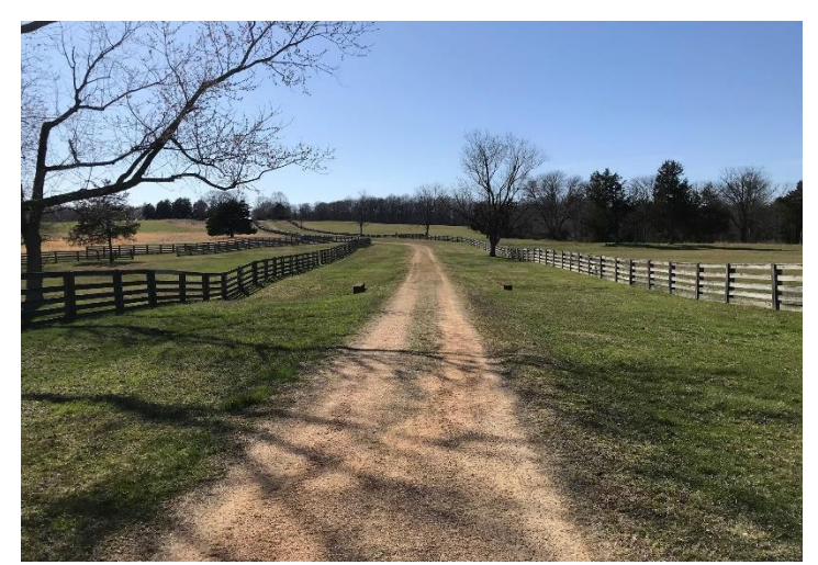
The Richmond-Lynchburg Stage Road just west of the village of Appomattox Court House. On April 9, General Gordon's Second Corp lined up near where the road veers to the left. Much of the Battle of Appomattox Court House was fought on the hillside pictured here and in the fields beyond it.

east of the village. The marines' location and role during this battle is not recorded and quite unclear. However, it is likely that they simply joined infantry regiments and fought in this battle.