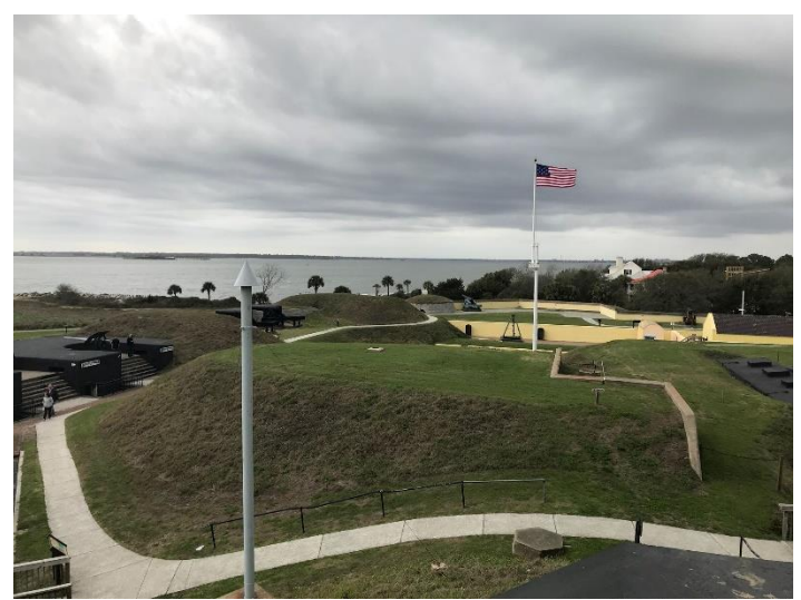
Fort Sumter and Charleston Harbor, where the night attack of September 8-9 took place, can be seen in the background of this modern-day image of Fort Moultrie.

same action.<sup>326</sup> Eventually, a portion of the Union force succeeded in landing near Fort Sumter, but were turned back after a short engagement with the Charleston Battalion, who rained bricks and grenades down upon them.<sup>327</sup> After the Union forces withdrew from the harbor and many of their boats had been reduced to splinters, the Confederates were left with three captured flags, four barges, and many prisoners.<sup>328</sup>